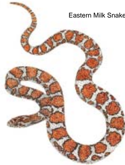
Eastern Milk Snake